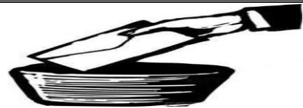
PLATE COLLECTIONS – 10/27/24

Mass intentions available for all Masses, envelopes in the back of both churches. Complete the information and put in the collection basket or bring to the church.